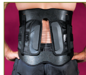
BOA with Chairback