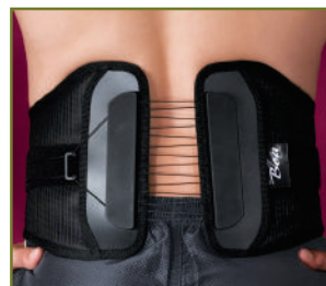
BOA 8" & 10"