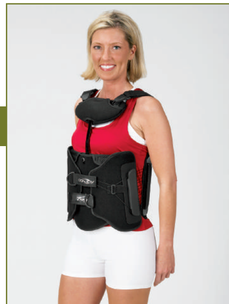
BOA Duel's Unique Dual Compression Action

The Duel TLSO is a unique prefabricated orthosis (patent pending) for post-operative, post-traumatic, or chronic spinal pathology. The Duel TLSO provides full-circumferential rigid support from the scapular thoracic region of the spine down to the Sacroccygeal junction. The Duel incorporates a telescoping sternal Y-bar that prevents excessive movement. The design works to create a three-point force system consisting of posteriorly directed force from the sternal and pubic pads; and an anteriorly directed force from the thoracolumbar pad. The pressure restricts forward flexion and encourages a hyperextension posture. The posture increases lumbar lordosis and stabilizes or locks the spine to resist lateral and rotary movements.